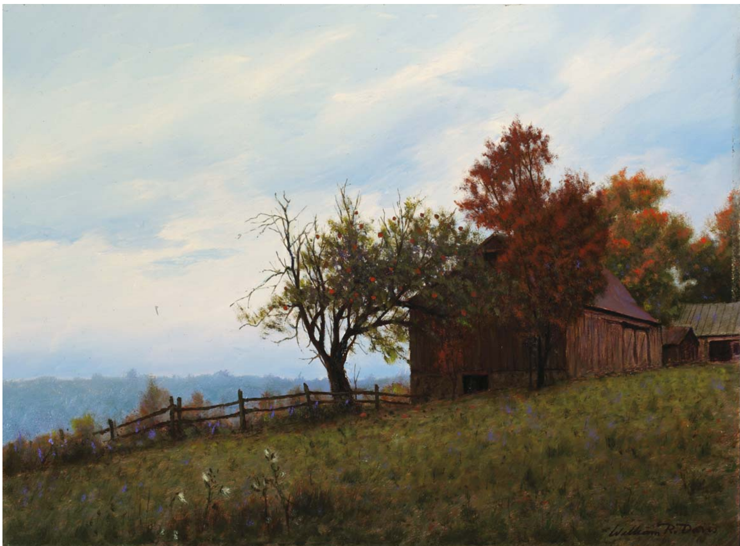
WILLIAM R. DAVIS, OLD BARN, READING, VERMONT, OIL ON PANEL, 12 X 16"