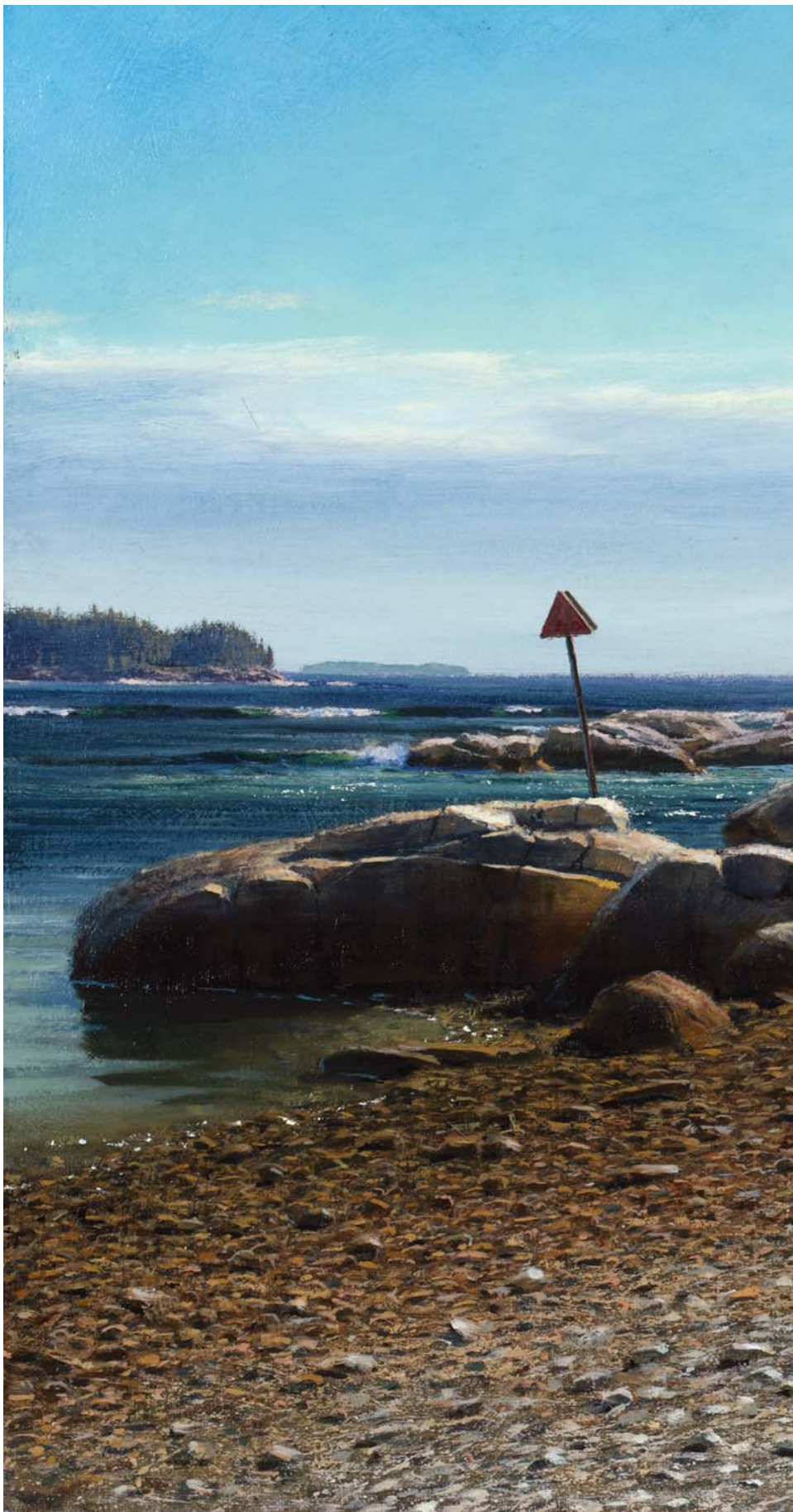
JOSEPH MCGURL, ISLAND, OIL ON CANVAS, 18 X 24"

"I strive to make my work in a realist fashion but not photographic. I use my paints in a way to project a sense of distance but also a moment in time using a powerful source of light," says Davis. "Most days painting outdoors the light is soft and even over the landscape. But I prefer to capture a time when a shaft or beam of light hits the surface and you