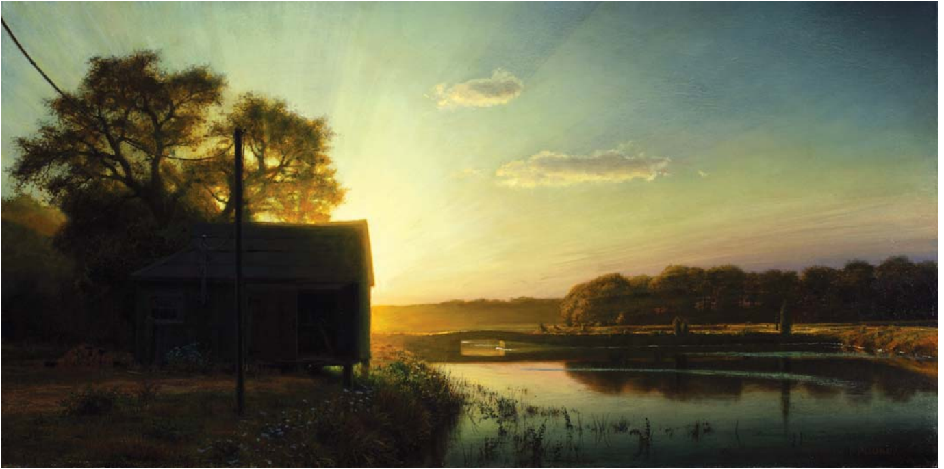
JOSEPH MCGURL, DAS RHEINGOLD, OIL ON PANEL, 18 X 36"