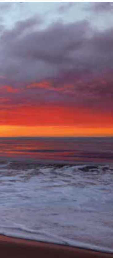
4 Adam Rhude, Unplugged , oil on linen, 12 x 14"