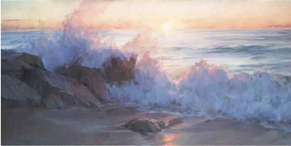
1 Karen Blackwood, Sunrise , oil on canvas, 18 x 36"